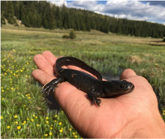
TIGER SALAMANDER.