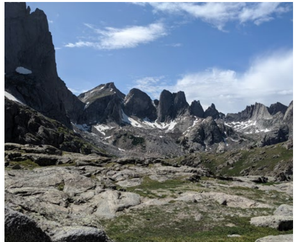
Middle Rockies - Abrupt elevation changes of 3,000 ft - 4,000 ft define a rugged landscape of sagebrush grasslands, coniferous forest, and sub-alpine meadows.