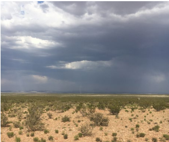
Apache Highlands - Mountain ranges dubbed "Sky Islands," covered in pine and conifer forests, rise abruptly from surrounding basins of grassland and shrub.