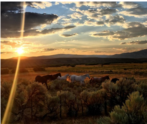
WILD HORSES.