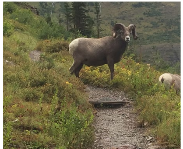
BIGHORN SHEEP.