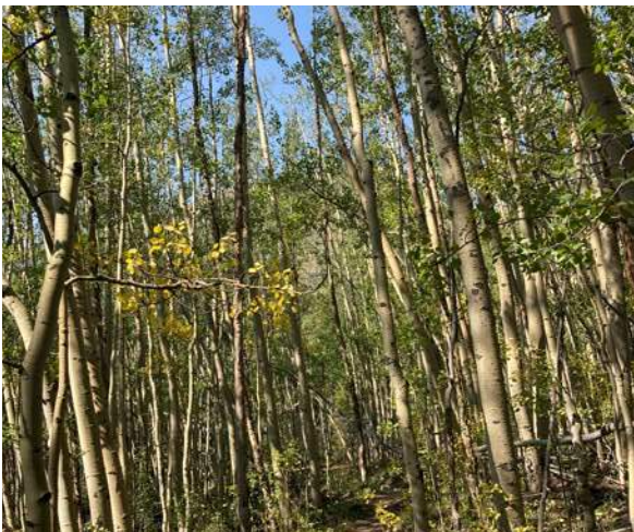
Aspen Forests - Aspens grow in a range of places from talus slopes, to deep soils, to dry ridges, to streamsides.