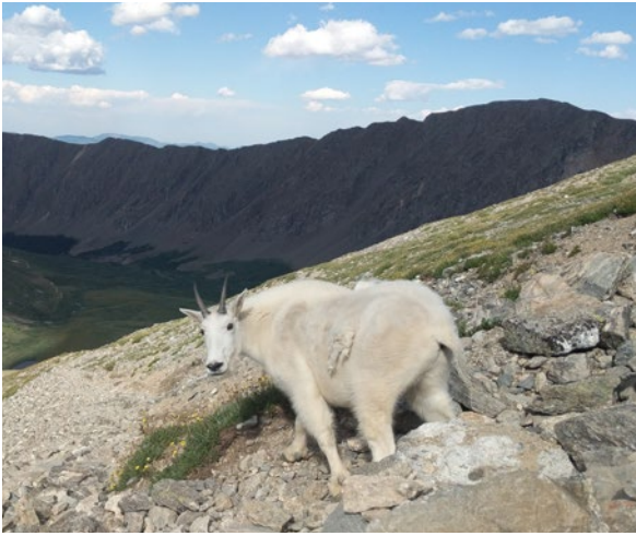
MOUNTAIN GOAT.