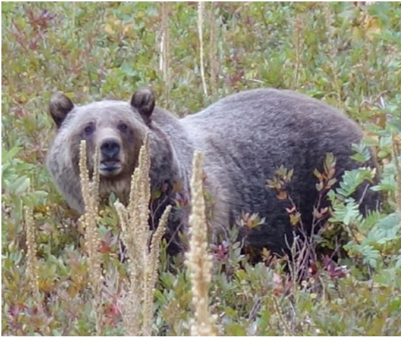
GRIZZLY BEAR.