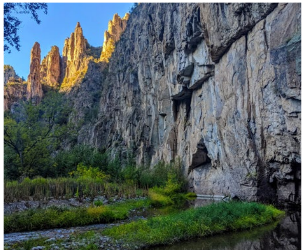
Riparian Zones - The areas along a river or stream, especially those in the desert and canyons, provide much needed moisture and offer a cool place for many animals.