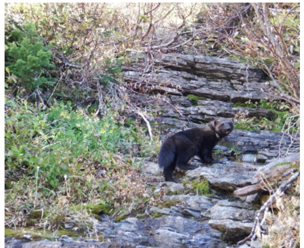
WOLVERINE.