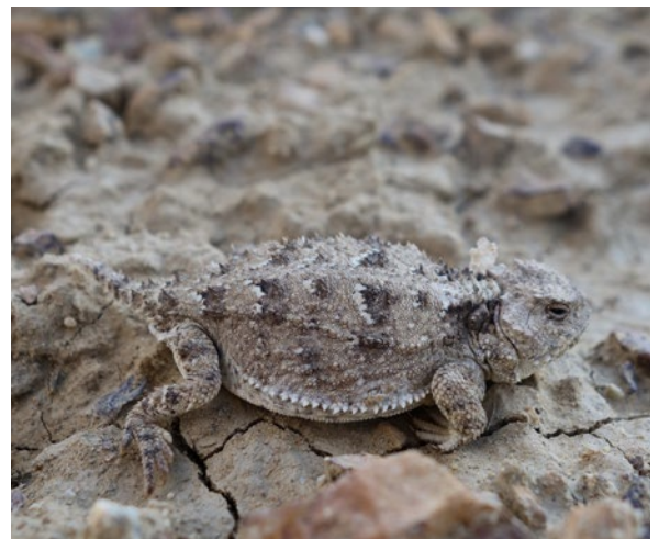
HORNED LIZARD or HORNY TOAD.