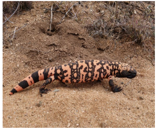
GILA MONSTER.