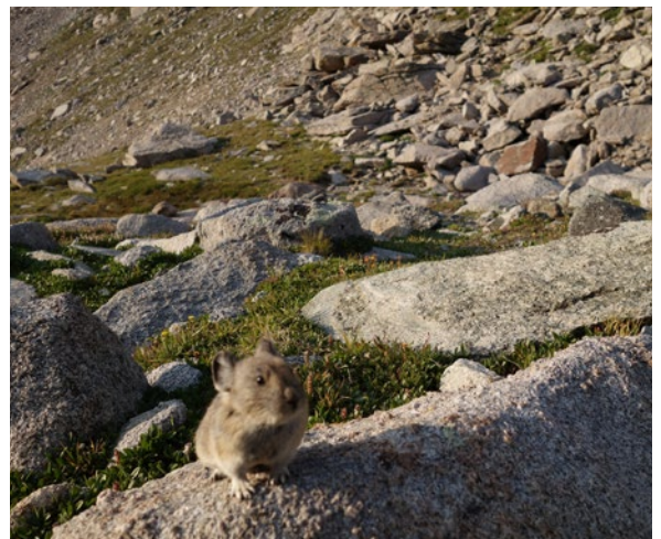
PIKA.