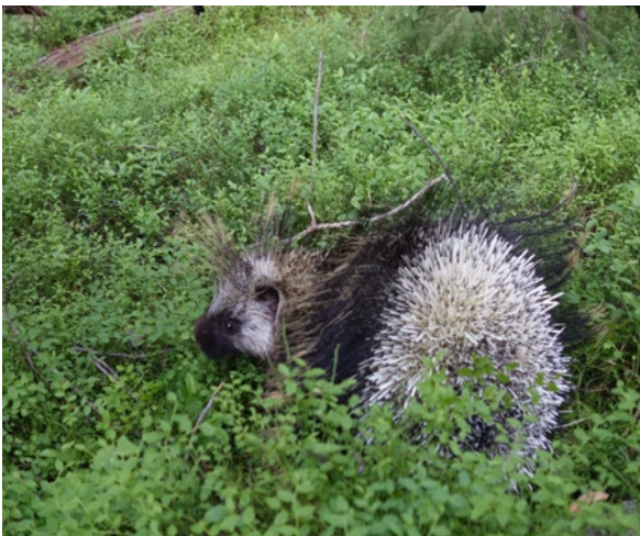
PORCUPINE.