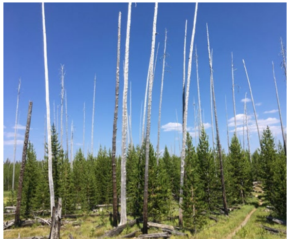
Conifer Forests - Coniferous (pine, spruce) forests can be found all along the Divide, often at higher elevations.