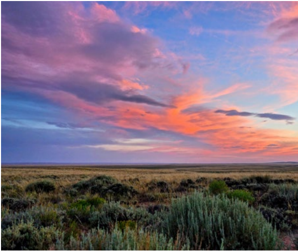
Wyoming Basins - A sea of sagebrush with unusual rock formations, sand dunes, and sagebrush communities including the Great Divide Basin.