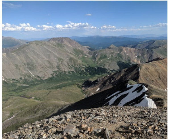
Southern Rockies - An ecoregion spanning diverse forest types, steep elevation gradients and some of the highest peaks in the contiguous U.S.