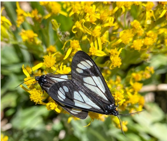
POLICE CAR MOTH.