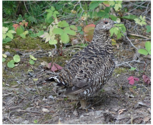
ROCK PTARMIGAN.