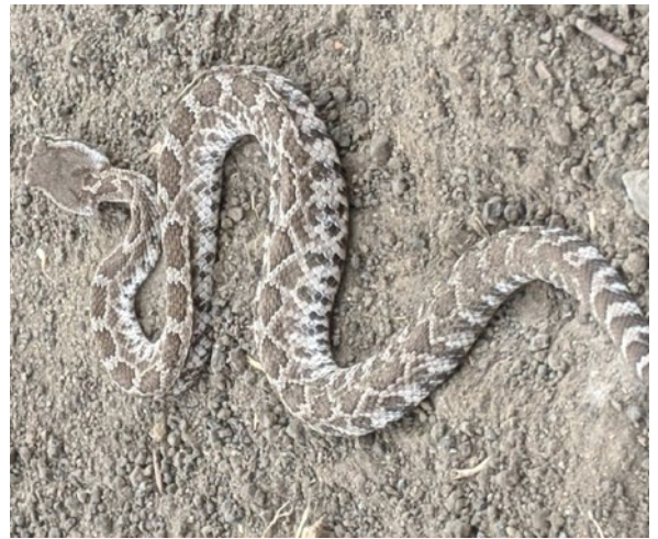
RATTLE SNAKE.