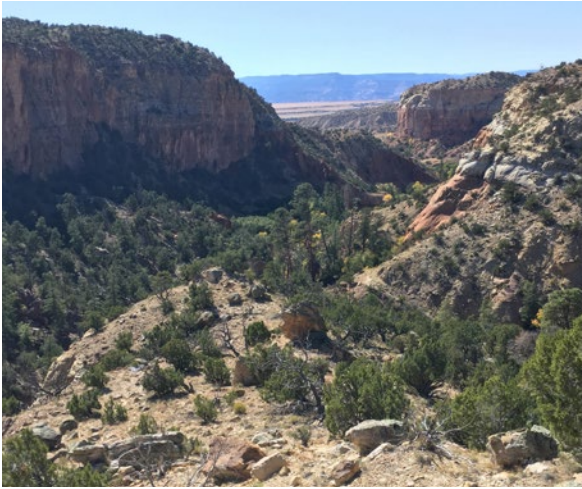
Arizona-New Mexico Mountains - Interspersed ranges known for large ponderosa pines and more species of birds and animals than any other place in the Southwest.