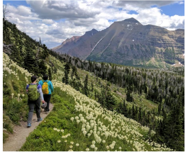
Northern/Canadian Rockies - Entirely glaciated as recently as 11,400 years ago, this region is defined by high mountain ranges separated by intermontane U-shaped basins.