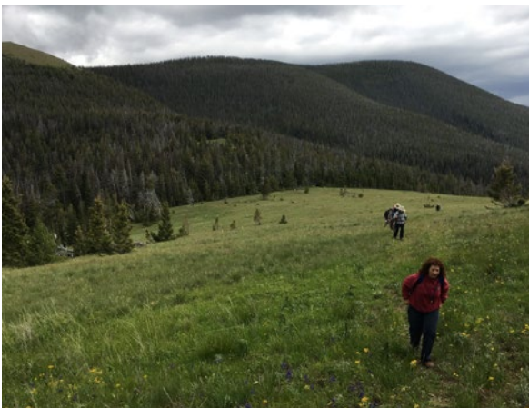
Mountain Meadows - Along the Divide, especially on lower elevation ridgelines, meadows dot the landscape between forests. These meadows are filled with wildflowers in the summer and rich communities of grasses and shrubs.